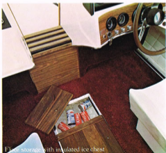
Floor storage with insulated ice chest

This warranty is in lieu of any other warranty, expressed or implied, or of any nature whatsoever.