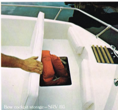
Bow cockpit storage - SRV 185