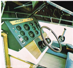
Fish traps - SRV 201 (left)