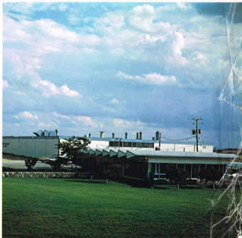
Oxford, Michigan Plant

Ask the man who owns one. We think you, too, will agree— Sea Ray—outstanding quality in fiberglass boats.