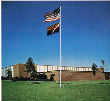
Merritt Island, Florida Plant