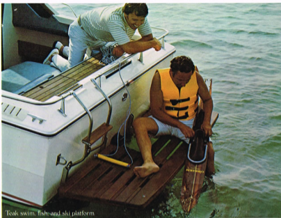
Teak swim, fish and ski platform

Warranty: For a period of one year from the date of delivery to the original purchaser, Sea Ray Boats warrants each Sea Ray boat to be free from defects caused by faulty workmanship or material.